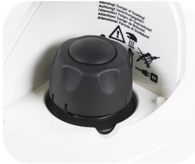
Removable electronic probe for monitoring limescale

A practical solution to clean your steam cleaner in a few simple steps.