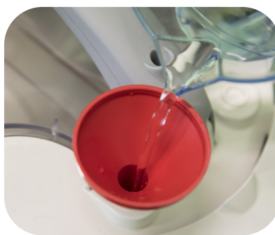
Continuous refill system

According to the contents of the bottle, it is possible to obtain either a mixture of steam with a water-detergent solution, or a mixture of steam and water, used with the hot water function.