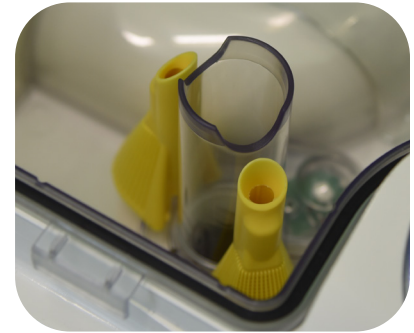
Patented RAIN SYSTEM water filter with Venturi technology

It also helps monitor the limescale level inside the system: you only need to unscrew it to easily remove any limescale present, thus avoiding the service costs.