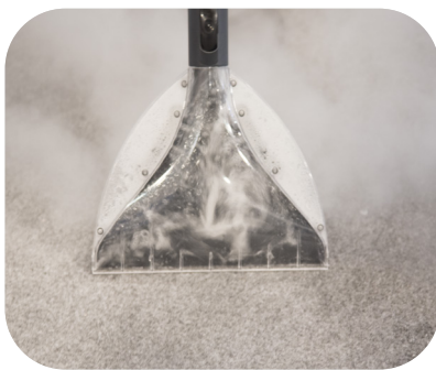
Washing-hot water extraction function

Our steam cleaners that combine steam and suction sanitization use Rain System technology. Pollen, mites, molds, spores and microparticles are sucked into the special patented water filter where two removable and washable side nozzles constantly nebulize high-pressure water, blocking all types of incoming contaminants and giving the environment a perfectly purified-outlet air stream