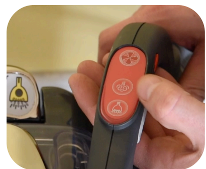
Handle for steam and suction control (with 3 adjustment levels)

SW2 is equipped with a continuous refill system. You will be able to sanitize without ever having to stop.